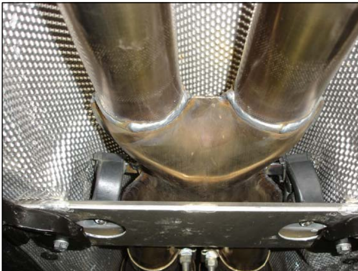
Fig # 2

Step 5: Once a final position has been chosen for the new system, evenly tighten all fasteners from front to rear. The supplied band clamps must be VERY tight to properly align the pipes and prevent leaks (Approximately 40ft-lbs). U-bolt clamps should be tightened to approximately 30-35ft-lbs. Inspect all fasteners after 25-50 miles of operation and retighten if necessary.