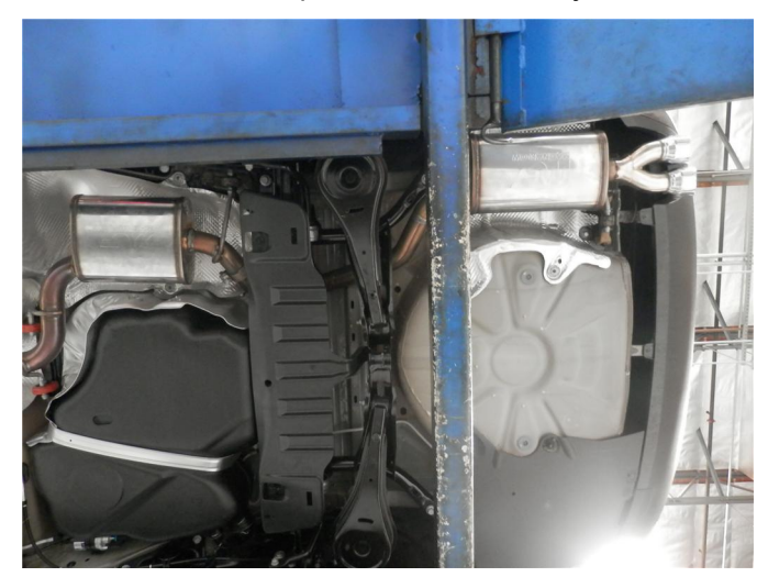
Step 4. Next use the supplied 2.25" clamp to loosely attach the Tailpipe Assembly to the Inlet Muffler Assembly. Finish by attaching the hangers into the rubber insulators.