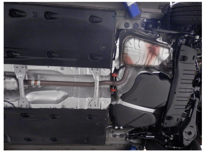
Step 2. Disengage hangers from rubber insulators and remove the OEM exhaust.