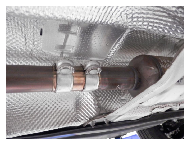
Step 1. Begin removal of the OEM exhaust system by loosening the band clamp attaching the exhaust to the catalytic converter. Do not discard or damage the OEM fasteners or rubber insulators as they will be used to install the new system.